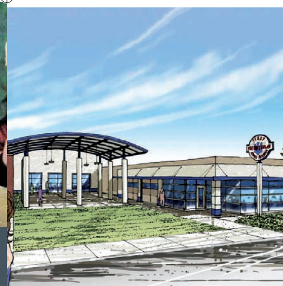
SCHEMATIC DESIGN - OPTION 1 FIRST PRESBYTERIAN CHURCH ATHENS, ALABAMA

This church has been serving for 186 years and using this building in such service for 126 years. However, the mission of this historic church is far greater than a building. Our mission is among the mighty acts of God and is a very vital part of what God is doing to redeem the world. By being good stewards of the facilities, we prepare to serve for the next 186 years, actively participating in what God is doing here on the Square and around the world.